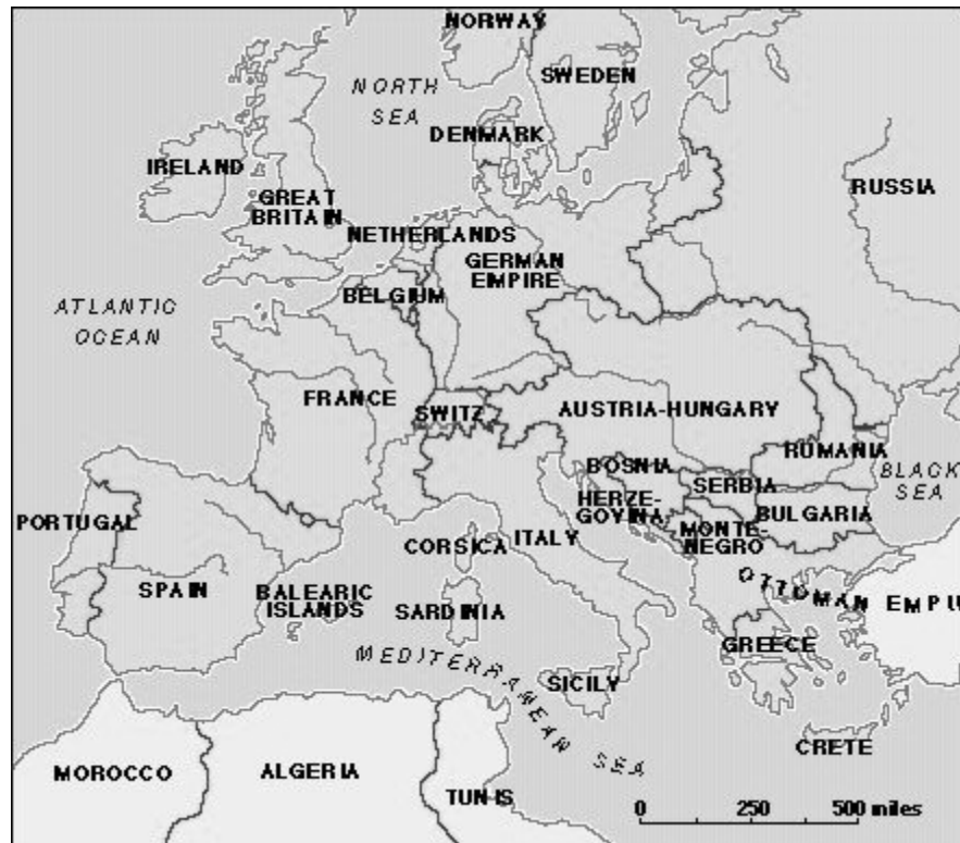
Europe after the Congress of Berlin 1878 263

The six great powers of Europe (Great Britain, Germany, Russia, Austria, France, and Italy) all had interests in the Balkan Peninsula. Diplomats and statesmen laid much of the groundwork for the Congress of Berlin before hand. 262 Access to the Dardanelles, the Aegean Sea, and the Black Sea were of utmost importance to trade and security.